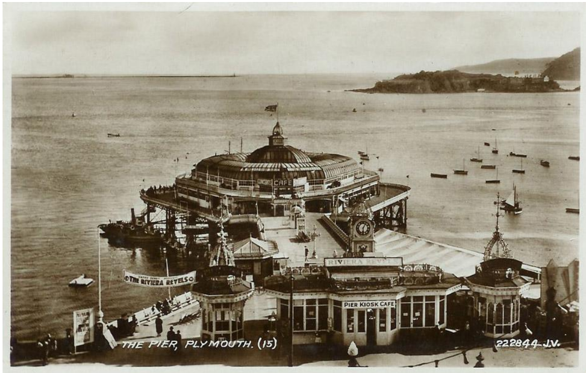
(Picture above - Plymouth Pier - Opened 1884 - Designed by Eugenius Birch)

During his career, Birch worked his way around the coast of Britain and built fourteen piers in total. The majority of the piers, included Blackpool, Brighton, Hastings, Eastbourne, and Scarborough, were erected in the 1860s using a screw-pile technique that Birch had perfected at Margate.