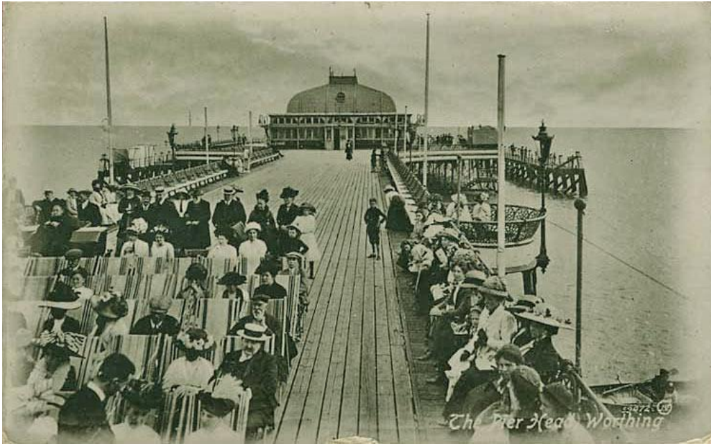
(Picture above - Worthing Pier - Opened 1862 - Built by the Worthing Pier Company)

Thus it was that piers reflected the innate connection between an island people and their surrounding sea, and enabled the day-visiting promenaders to imagine that they were indeed walking on the deck of an ocean-going ship. And it is no small wonder that their popularity has stood the test of time and changing fashion.