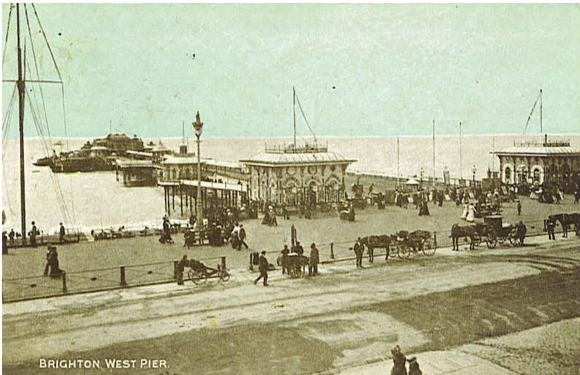
(Picture above - Brighton, West Pier - Opened 1863 - Designed by Eugenius Birch)

In 1863, Blackpool's North Pier was completed, by Birch, at a cost of £13,500.