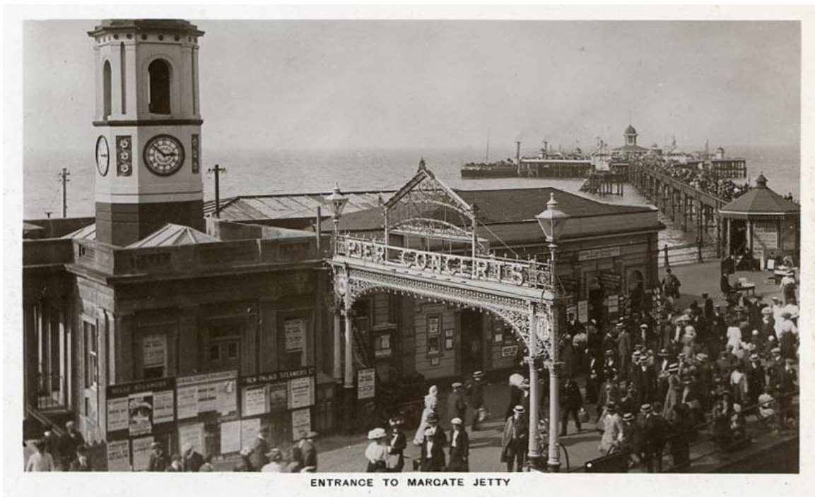
(Picture above - Margate Jetty - Opened 1855 - Designed by Eugenius Birch)

Moreover, piers were also venues for mass entertainment, with concert halls, theatres, bandstands, sideshows, and landing stages for sightseeing steamers. Consequently, piers became a vital attraction for the developing seaside resorts of the 19th Century.