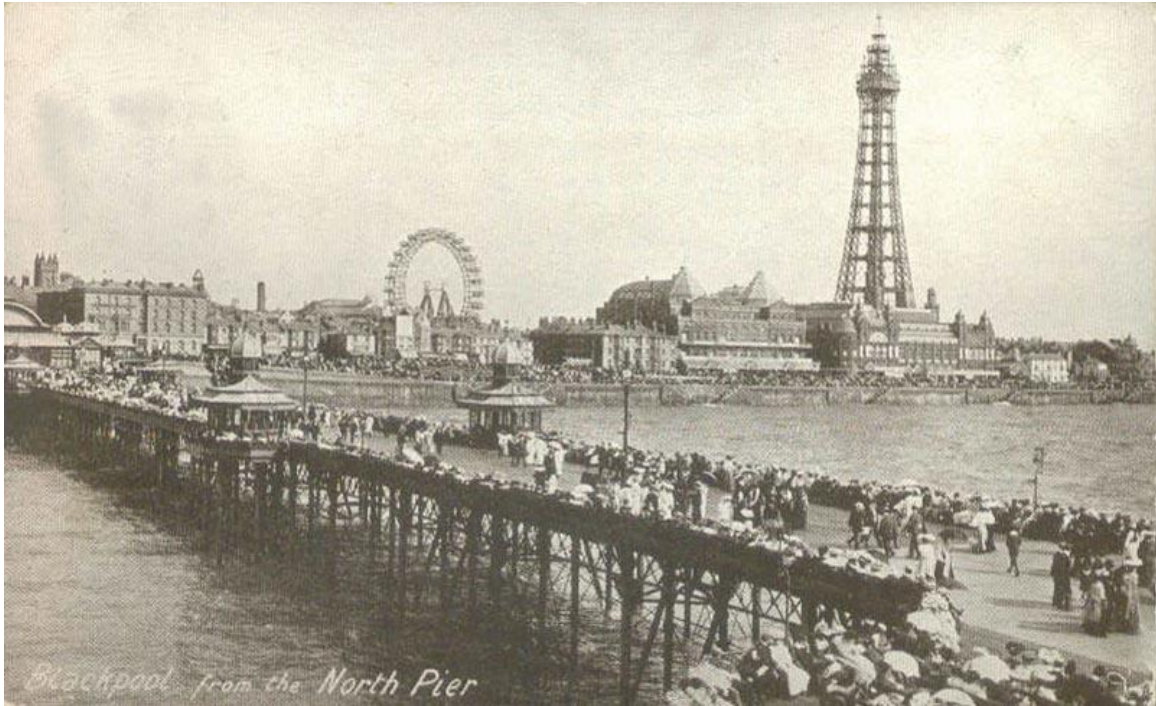
(Picture above - Blackpool, North Pier - Opened 1863 - Designed by Eugenius Birch)

In 1863, Blackpool's North Pier was completed, by Birch, at a cost of £13,500.