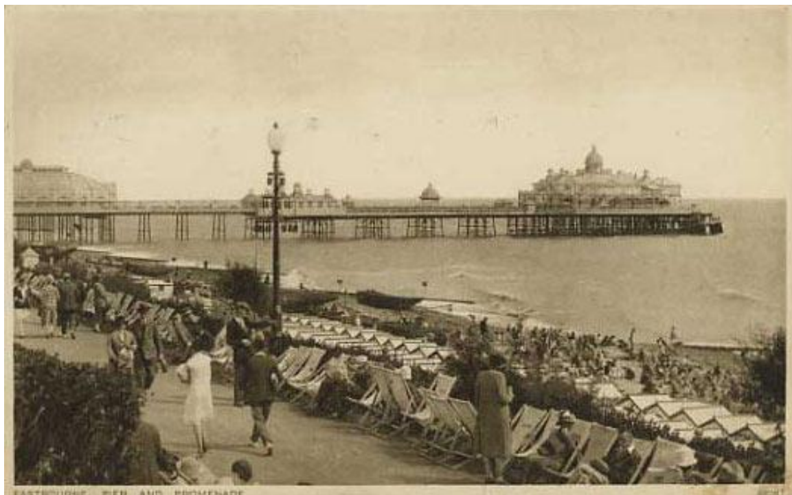
(Picture above - Eastbourne Pier - Opened 1872 - Designed by Eugenius Birch)

During his career, Birch worked his way around the coast of Britain and built fourteen piers in total. The majority of the piers, included Blackpool, Brighton, Hastings, Eastbourne, and Scarborough, were erected in the 1860s using a screw-pile technique that Birch had perfected at Margate.