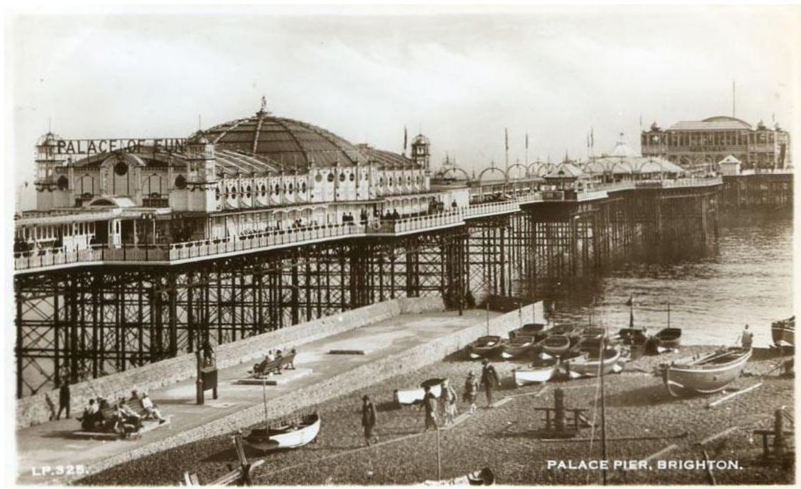
(Picture above - Brighton Palace Pier- Opened 1899 - Designed by R St George Moore)

Brighton's Palace Pier (started in 1891) reflects the intricate architecture and elegance that evolved with the seaside pier.