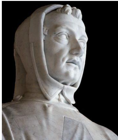
Leonardo Fibonacci (c.1170-c.1250)