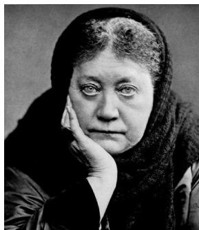
Above - Helena Petrovna Blavatsky (1831-1891) - "Messenger of Theosophy". Theosophy is "a fragment of the ancient, once universal, wisdom teaching".

To date (2010), only five root races have appeared on the earth, and the 6th root race is predicted by theosophists to emerge in the 28th century. The 7th root race will only appear several million years in the future.