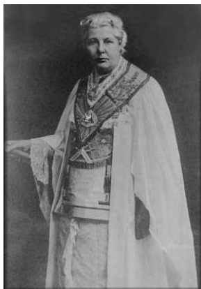
Above - Annie Besant (1847-1933) - In Regalia of Co-Masonry 3rd Degree