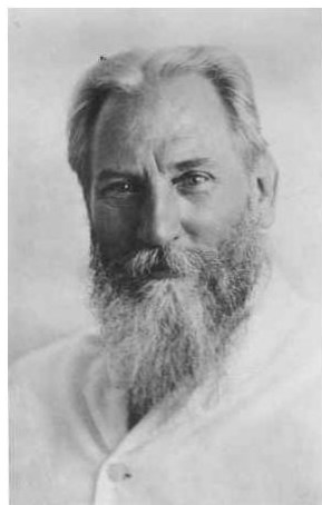
Above - Charles Webster Leadbeater (1854-1934)

Both Scott-Elliot and Besant relied heavily upon information from Charles Webster Leadbeater who had obtained it through "astral clairvoyance".