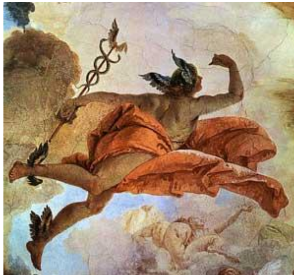
The Roman God, Mercury, holding the caduceus

Hermes was the only Olympian god who had the authority, symbolised in the caduceus, to visit Heaven, Earth, and the Underworld.