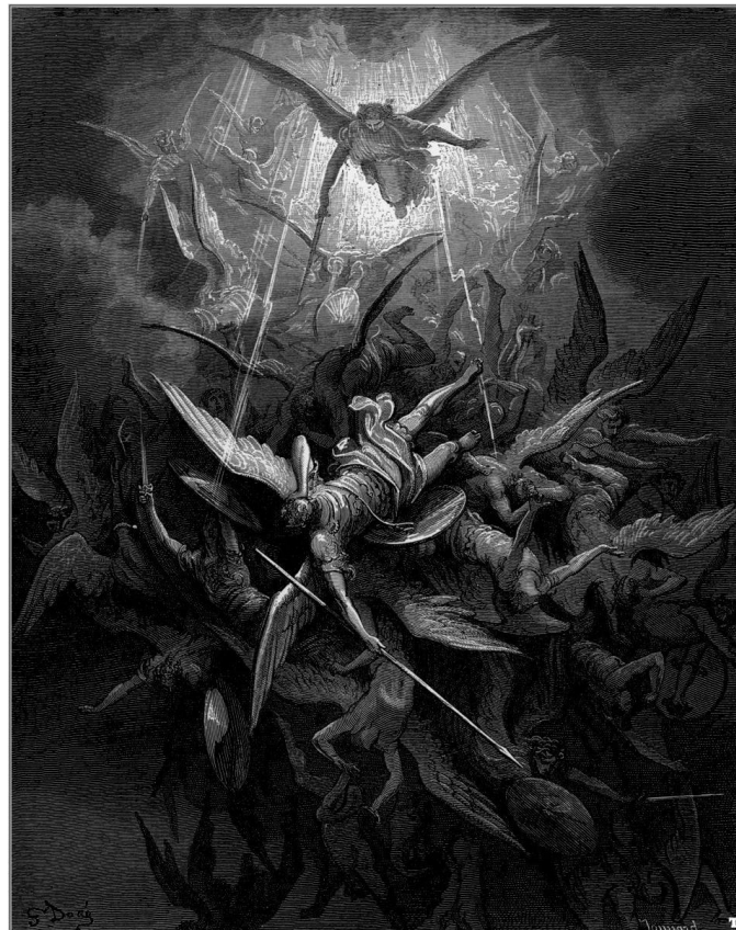
(Picture above - Michael casts out Lucifer and the Angels (1/3 of the host of Heaven) who followed him - The War in Heaven)

In both cases the Angels turned from God, by misusing the "free will" that had been granted to them by God himself.